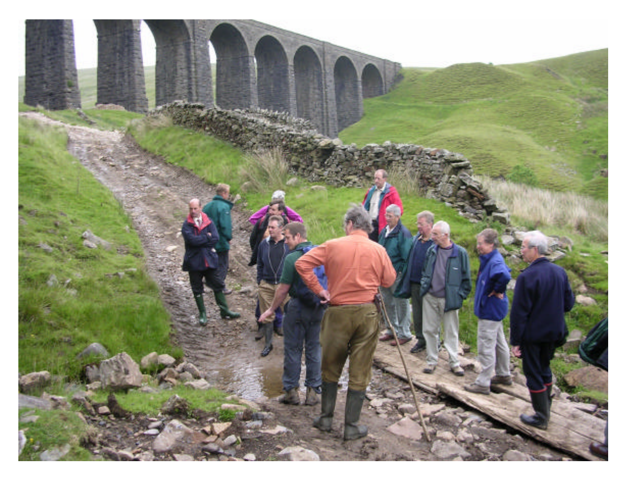
Yorkshire Dales Access Forum on site visit to Arten Gill

Many members have secondary interests as well as the primary interest for which they were appointed.