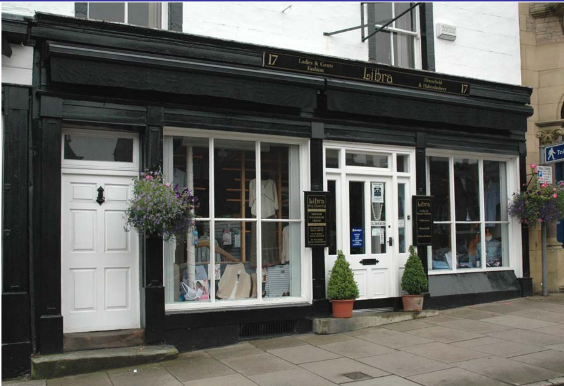
Attractive and well-maintained early Victorian styled shopfront, Boroughgate, Appleby

Although largely still on classical, albeit less delicate lines, Victorian shopfronts showed greater variations, particularly in their materials. Advances in glass technology and the introduction of plate glass in the 1820's allowed larger window panes and from about 1840 horizontal glazing bars (transoms) tended to disappear. Heavier mullions were required to hold the larger and heavier sheets of glass and Victorian shopfronts often have thicker mullions – sometimes thin colonettes or mullions terminating in elliptical (arched) heads. Windows were divided into two, three or four lights. A large number of shopfronts of this period have also been lost, although some have simply been re-glazed without their mullions.