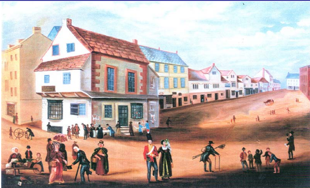
Georgian bowed oriel windows, Devonshire Street, Penrith 1815

From the eighteenth century onwards, and particularly in the nineteenth century, most shops were designed or remodelled with an integral shopfront, usually at ground floor level and on classical (Greek) lines. Great importance was placed on the design and the vertical proportions of the building as a whole, and of the shopfront itself.