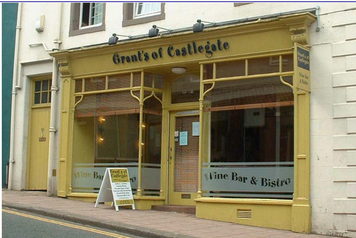
This contemporary colour scheme, signage and styling show how a modern business can successfully utilise an early 1920's Edwardian styled shopfront