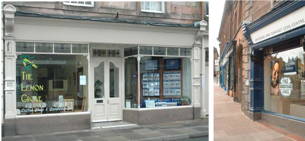
Attractive early twentieth century Edwardian styled shopfronts, Bridge Street Appleby and Cornmarket, Penrith

emphasis resulted. A significant number of these shopfronts survive and are very popular still. Many Edwardian shop doors were almost totally glazed, with only a small panelled area at the bottom.