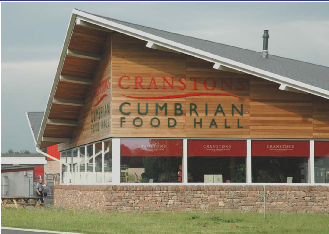
A modern, striking shop unit, utilising natural and local materials