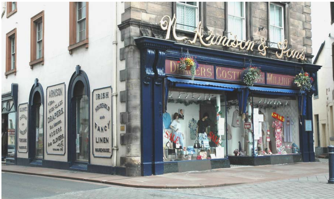
Arnison's, one of Eden's most striking shopfronts. The outer body of the shopfront is late Victorian with an Edwardian remodelling within

In the later nineteenth century, first floor display windows also became more prevalent, such as those surviving at no's 5-6 Devonshire Street (currently Shoe Zone) and at 45 & 46 King Street (currently Cumbria Photo and Lakeland Office Point).