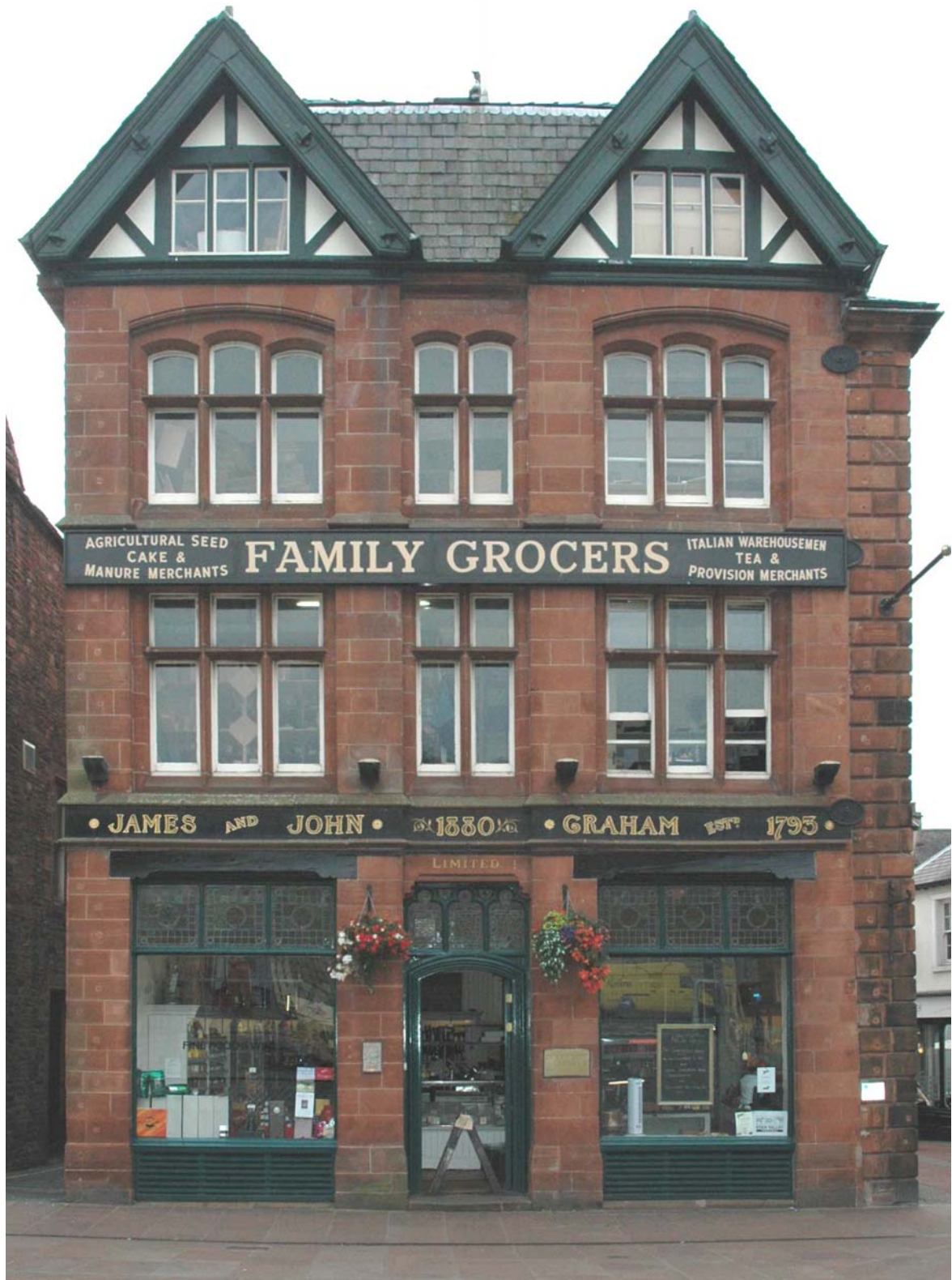
J & J Graham. Building with integral shopfront c1880