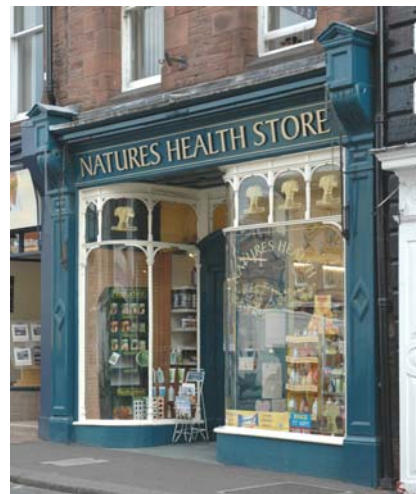
An attractive and well-maintained traditional shopfront with fully-retractable canvas blind

Modern flat canvas retractable blinds may be an acceptable alternative on some unlisted buildings. However, these often have plastic blind boxes, and although these can be fitted with timber covers, they often have frills which do not fully retract and can look unsightly, particularly as they get dirty. These modern versions are often motor operated and the operating mechanism makes them more bulky than the traditional blinds.