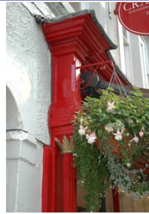
Modern retractable blind on re-glazed Victorian Shopfront, King Street, Penrith

Modern plastic or plastic-coated fixed 'Dutch blinds' (designed like a pram hood) are not acceptable on traditional buildings or in conservation areas. These can look unattractive and permanently obscure the shopfront. The partly retractable versions of these blinds, which do not fold back fully into the shopfront, can also look unsightly when shut and should be avoided. The canvas versions of such blinds are more attractive.