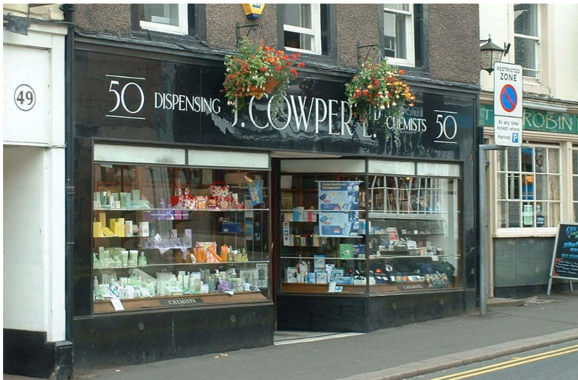
Surviving 1930's shopfront, King Street, Penrith

A reaction to this traditional and relatively ornate detailing took place in the 1920's and 1930's with a reduction in the level of embellishment. Nevertheless, a deliberate and thoughtful style emerged and the use of mahogany, bronze, chrome and polished materials such as Vitrolite glass and granite became notable. Shopfronts were sometimes on new or completely remodelled buildings. A number of shopfronts from this period survive in Penrith, sometimes obscured by later modifications such as deepened fascias eg Burton's Middlegate, Penrith (1937).