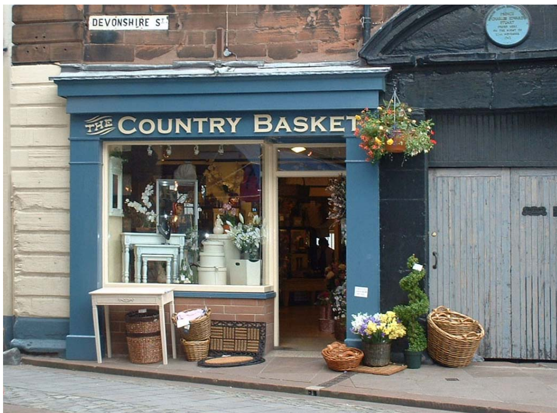
A modern, attractive and well-presented shopfront in a historic building

The design, whatever the style chosen, should be of good quality and materials and even if a modern or innovative style is chosen, the shopfront should be designed not only as part of the building, but with respect to the streetscape and locality in which it sits. Using local natural materials and reflecting local traditional stylistic and constructional techniques will be strongly encouraged.